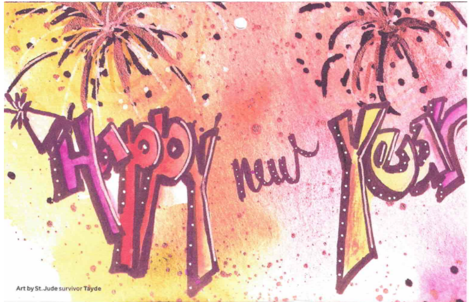
This picture was made by one of the children at The St. Jude Hospital.